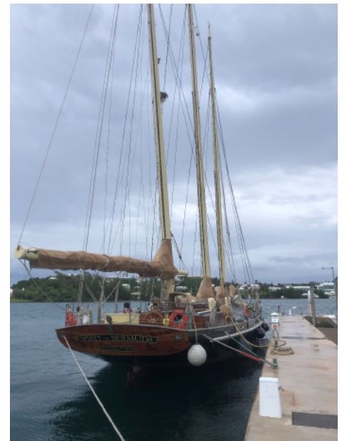
Photo 7: The Spirit of Bermuda – a regular competitor in the Marion to Bermuda Race.