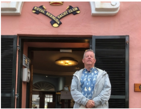
Photo 9: The "Other" Yacht Club in Hamilton. RBYC will host the Newport to Bermuda Race on June 17th 2022.