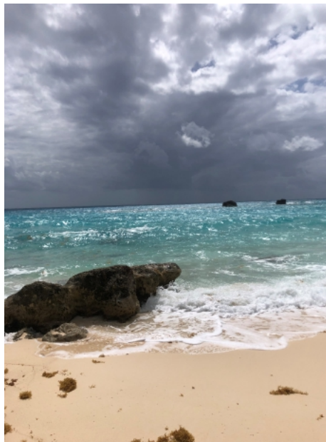
Photo 5: A nasty squall in the Atlantic Ocean blows through quickly.