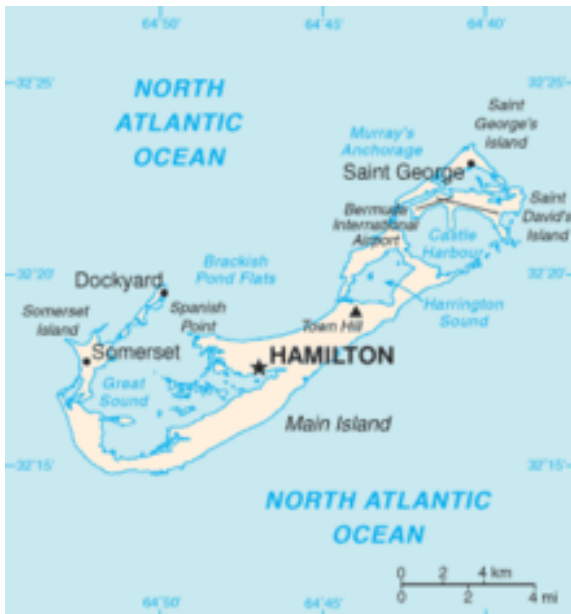
Figure 1: Map of the Island Colony of Bermuda.

Lynne and I took a week trip to Bermuda last month. The island of Bermuda is a physically dormant volcano in the middle